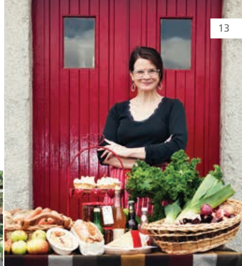
'Only the freshest of produce is used with the highest standards of traceability.'

Believing the fewer food miles, the better, ingredients are sourced from the locality which offers an excellent range of farmhouse cheeses, free range eggs, seasonal fruit, vegetables and meats. The cosy interior of The Forge carries a display of artwork crafted by nearby artists and a Slí na Sceacha walk around the immediate hedgerow begins from the car park. Open seven days a week, from 9.30am to 5.00pm, The Forge serves breakfast, morning coffee, lunches and afternoon tea.