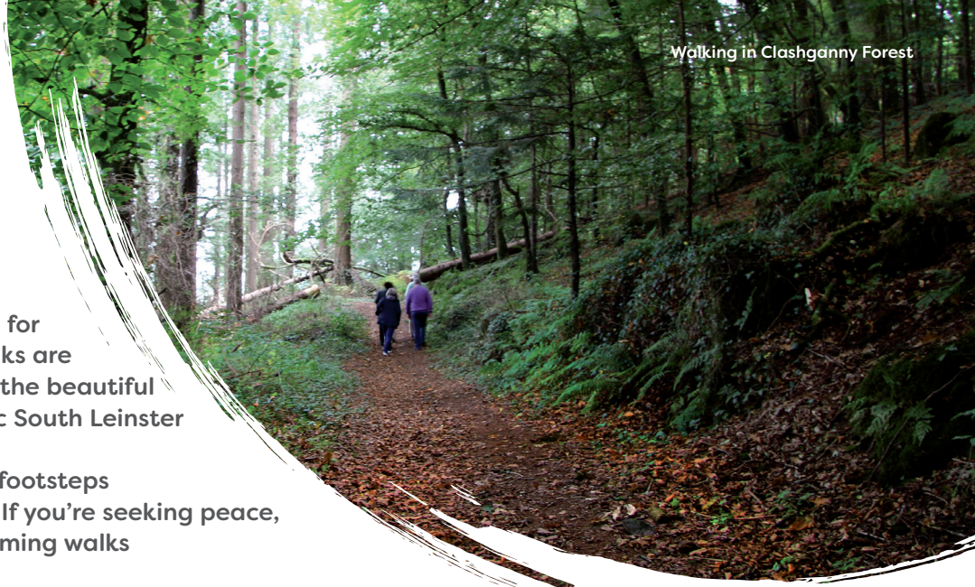
Walking in Clashganny Forest

Graiguenamanagh and Graiguenamanagh to St Mullins. The South Leinster Way - from Kildavin to Graiguenamanagh. The Wicklow Way ends in the village of Clonegal. Huntington Castle located in the village centre is open every weekend in November and December featuring castle tours, a beautiful tea rooms and some beautiful walks through the estate.